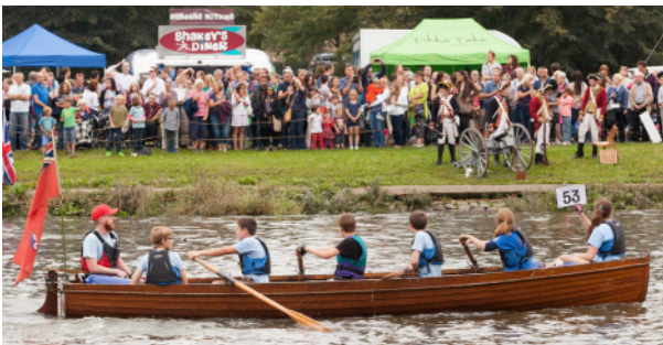
Scouts (interesting starting position, but still class winners !)