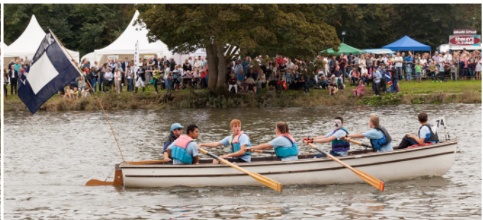
Explorers (a seriously competitive crew)