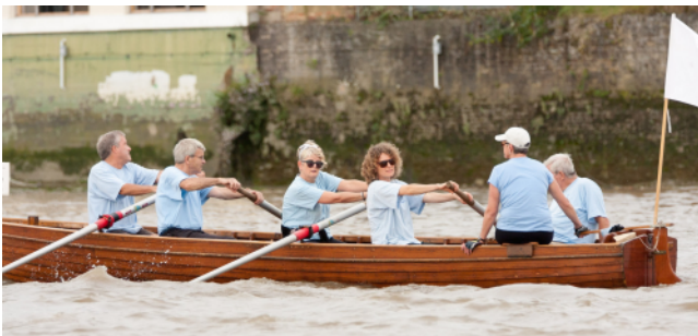
Guild (record-breaking time, despite taking on all that water...)