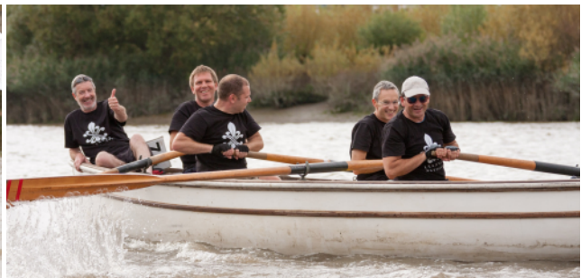
Mutineers (the training helped, but the new flag and go-faster T-shirts really made the difference)

This year's Great River Race saw all the Leander crews finish in a very good time, despite the choppy conditions from the start to the Pool of London.